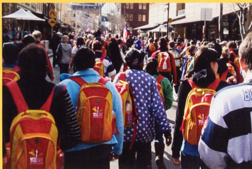
World Youth Day crowds in Sydney's Rocks precinct

The MAGiS program provided a wonderful opportunity to work with the other Ignatian Congregations..... Faithful Companions of Jesus, Religious of the Sacred Heart, Loreto Sisters and the Jesuits. The five Congregations also had a combined booth at the Vocation Expo at Darling Harbour during WYD.