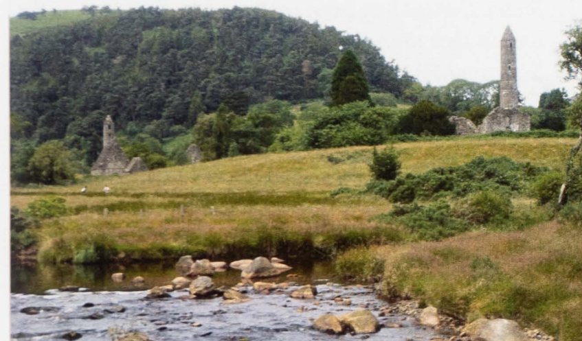
Glendalough: One of the earliest monastic sites in Ireland, founded in the sixth century by Saint Kevin