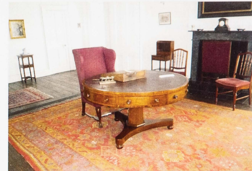
Mary Aikenhead's room at the Mary Aikenhead Heritage Centre, Harold's Cross, Dublin

A video presentation of the pilgrimage is being produced, with copies to be sent to each community. Look forward to sharing the enlightenment, joy and discovery of the pilgrims as they journey through Ireland.