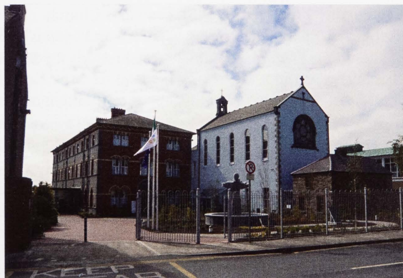
The Edmund Rice Heritage Centre, Cork