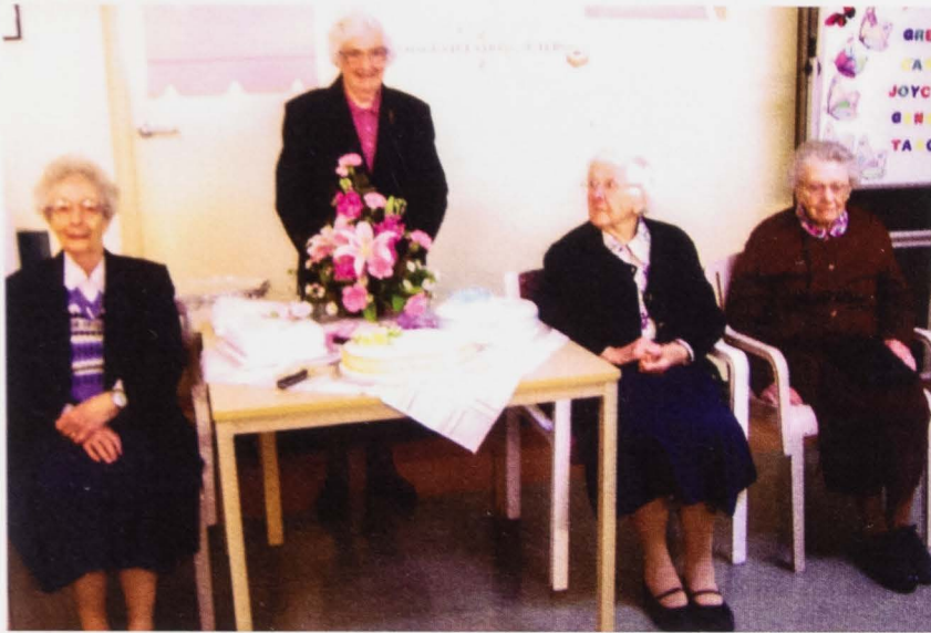
Platinum Jubiliarians at St Joseph's Auburn