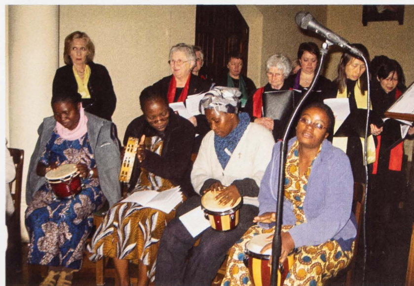
Our Zambian and Nigerian Sisters (WYD Pilgrims) drumming