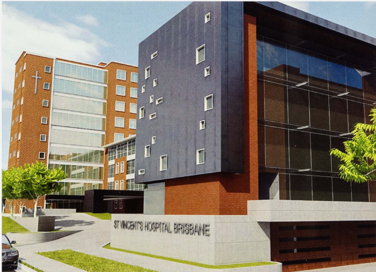
Artist's concept of the new hospital at Mt Olivet

Brisbane's Mt Olivet Hospital has begun work on a $35 million upgrade and extension to its facilities to create a general medical hospital of excellence specialising in the area of general medicine, gerontology, palliative care, rehabilitation and other specialised programs focusing on chronic disease management.