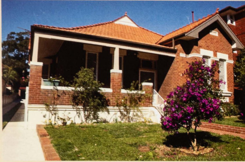
Bethlehem Convent in Ashfield