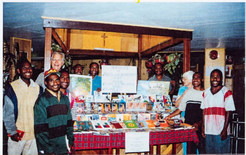
A display of the things I brought back from Port Moresby