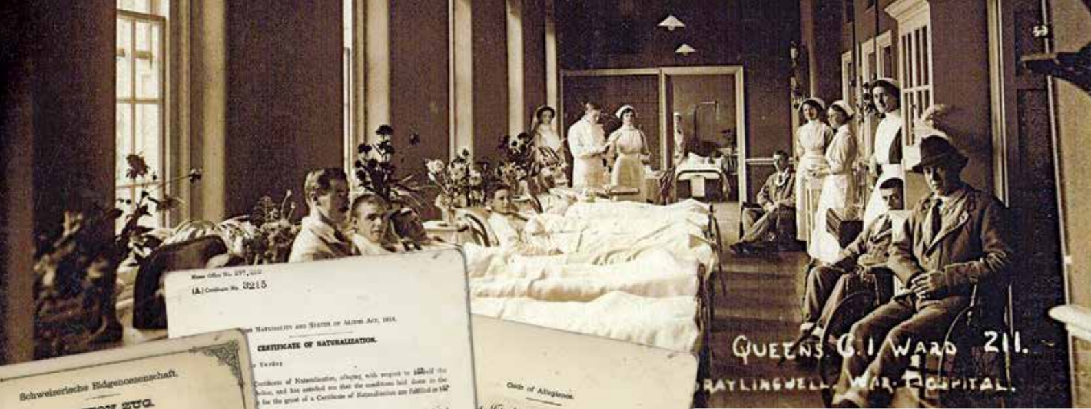
QUEENS G.I. WARD 211. GRAYLINGWELL MILITARY HOSPITAL.