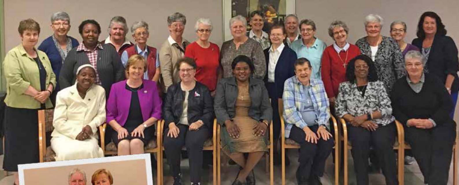
The UNANIMA Board